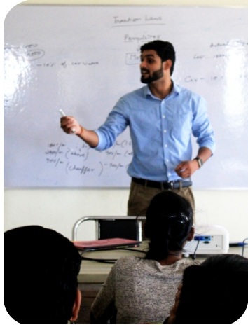
Bachelor of Business Administration

Study Hall College is an inclusive place for students of all abilities, from all Socio-economic backgrounds, from rural and urban regions, fostering collaboration, creativity, entrepreneurship and innovation