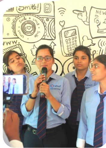
Bachelor of Journalism & Mass Communication