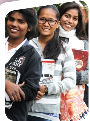
Bachelor of Commerce