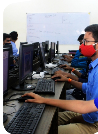
Bachelor's in Computer Application